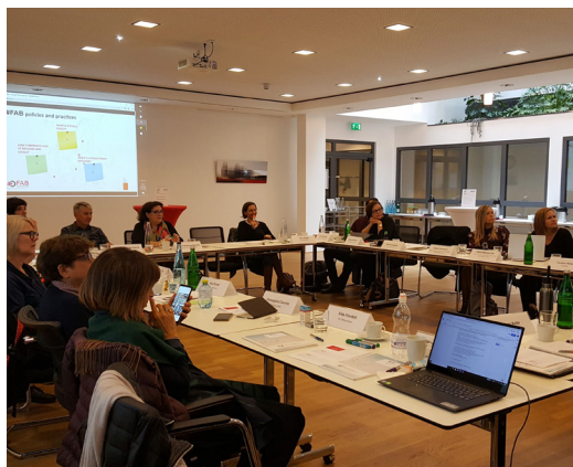
The picture above refers to the Third Management and Steering Committee Meeting of the project, in Berlin.

On 21 and 22 October 2019, the Third Management and Steering Committee Meeting of the project “FAB – Fast Track Action Boost” took place in Berlin. The FAB project aims at developing a European transferable Partnership and Intervention Model for fast integration of refugees, in particular female refugees, into the labour market by exchanging urban refugee policies and good practice between the participating cities and by study and mentoring visits, pilot projects and other actions.